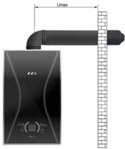
Horizontal Hermetic Flue Application L max. distance with single elbow: 10 m, Ø60/100 L max. distance with single elbow: 20 m, Ø80/125