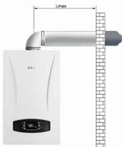
Horizontal Hermetic Flue Application L max. distance with single elbow: 10 m, Ø60/100 L max. distance with single elbow: 20 m, Ø80/125